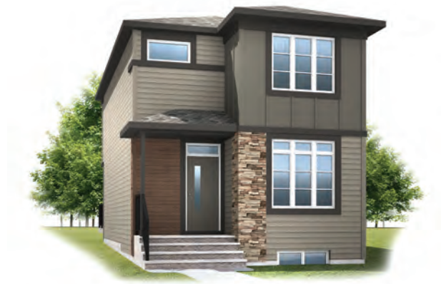
THE MENSA ELEVATION F2