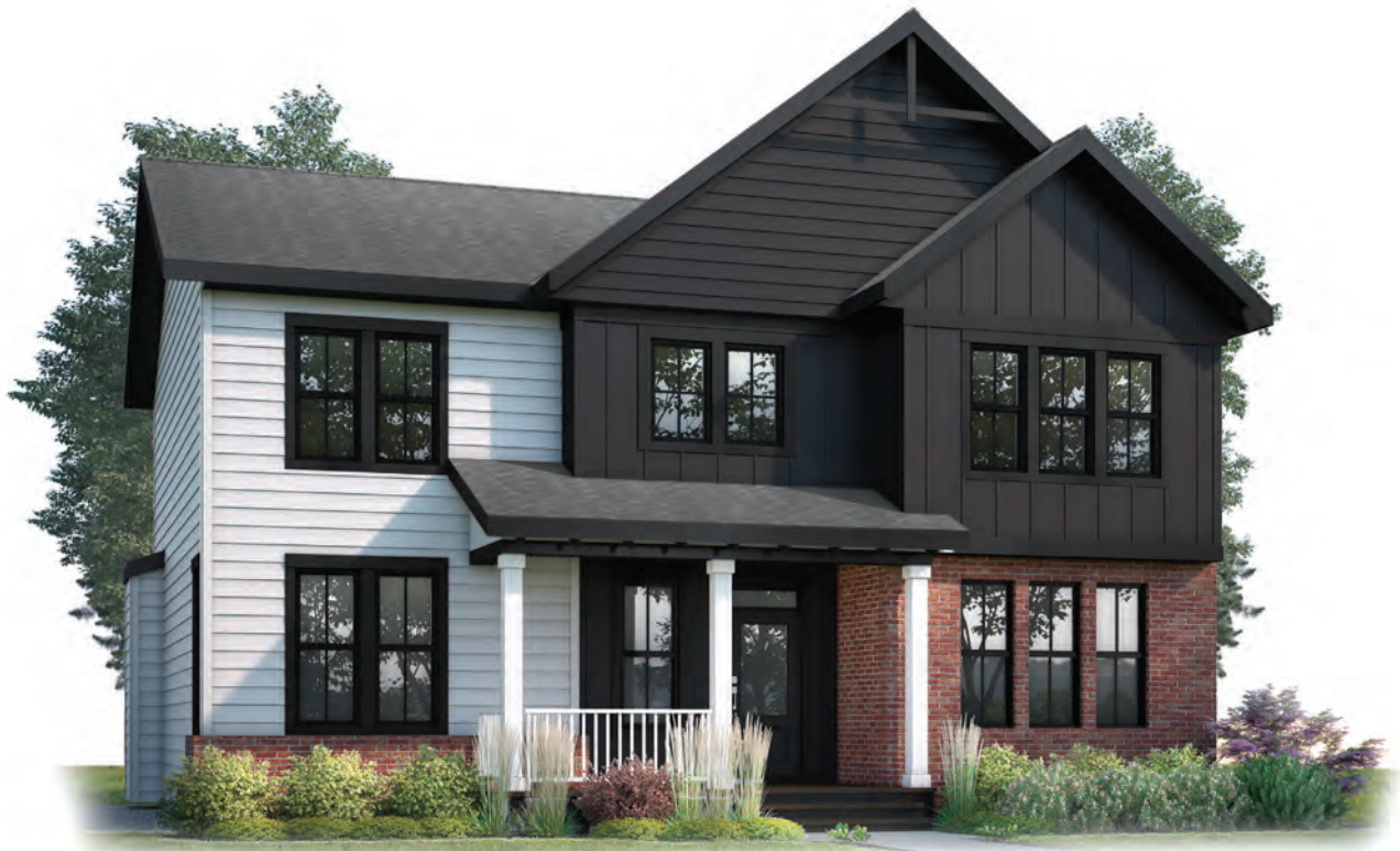
VINTAGE WIDE LANE AP1